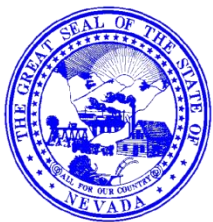
JOE LOMBARDO Governor

400 W. King Street, Suite 106 Carson City, Nevada 89703 (775) 684-7040 • Fax (775) 684-7052 http://minerals.nv.gov/